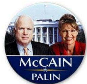
(Phelps from page 1)

Little kids note... Although the film is PG-13 there are some downright creepy supernatural bad-dies that might cause nightmares for junior viewers. If you haven't seen this go rent it, it's cool.