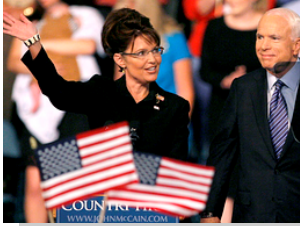
(McCain from page 1)

VP selection history, John McCain chose the woman who is inarguably the hottest Governor in the USA. This is an incredible move by the maverick McCain. The risks are enormous. This beautiful CEO of America's largest state by area, has a fairly thin resume that includes running the Alaska National Guard, Mayor of a small town and of course two years as Governor. McCain doesn't need anyone to pad his resume as he has enjoyed a long career in the Senate.